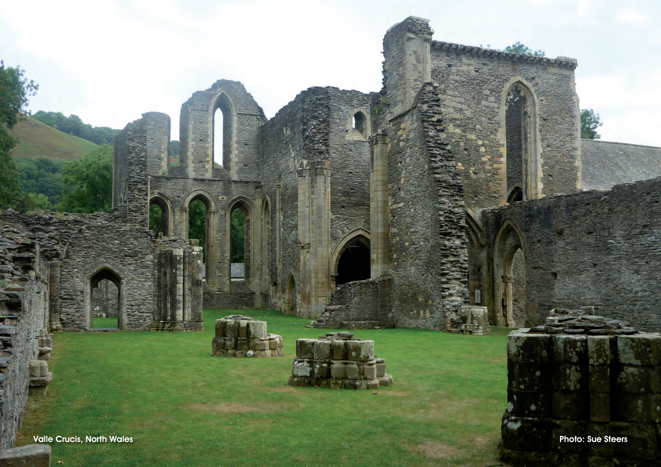
Valle Crucis, North Wales