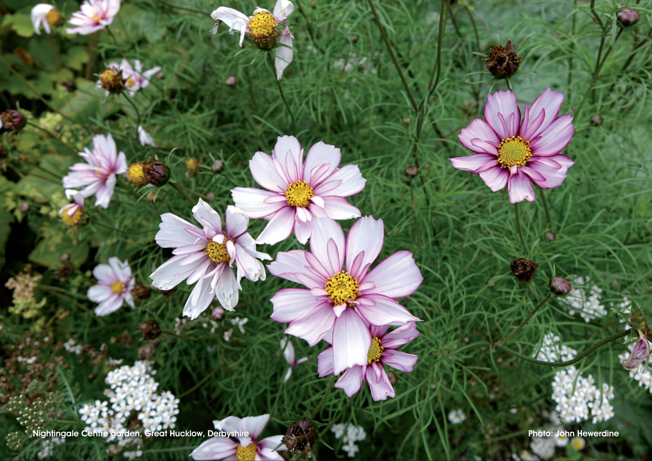
Nightingale Centre garden, Great Hucklow, Derbyshire