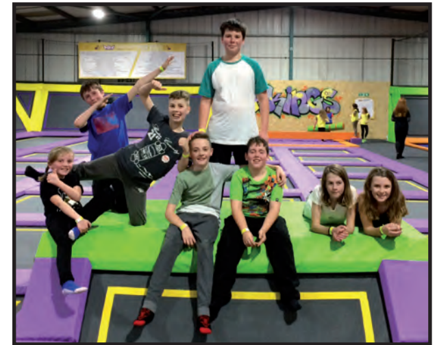
Jumping Scouts in Scunthorpe