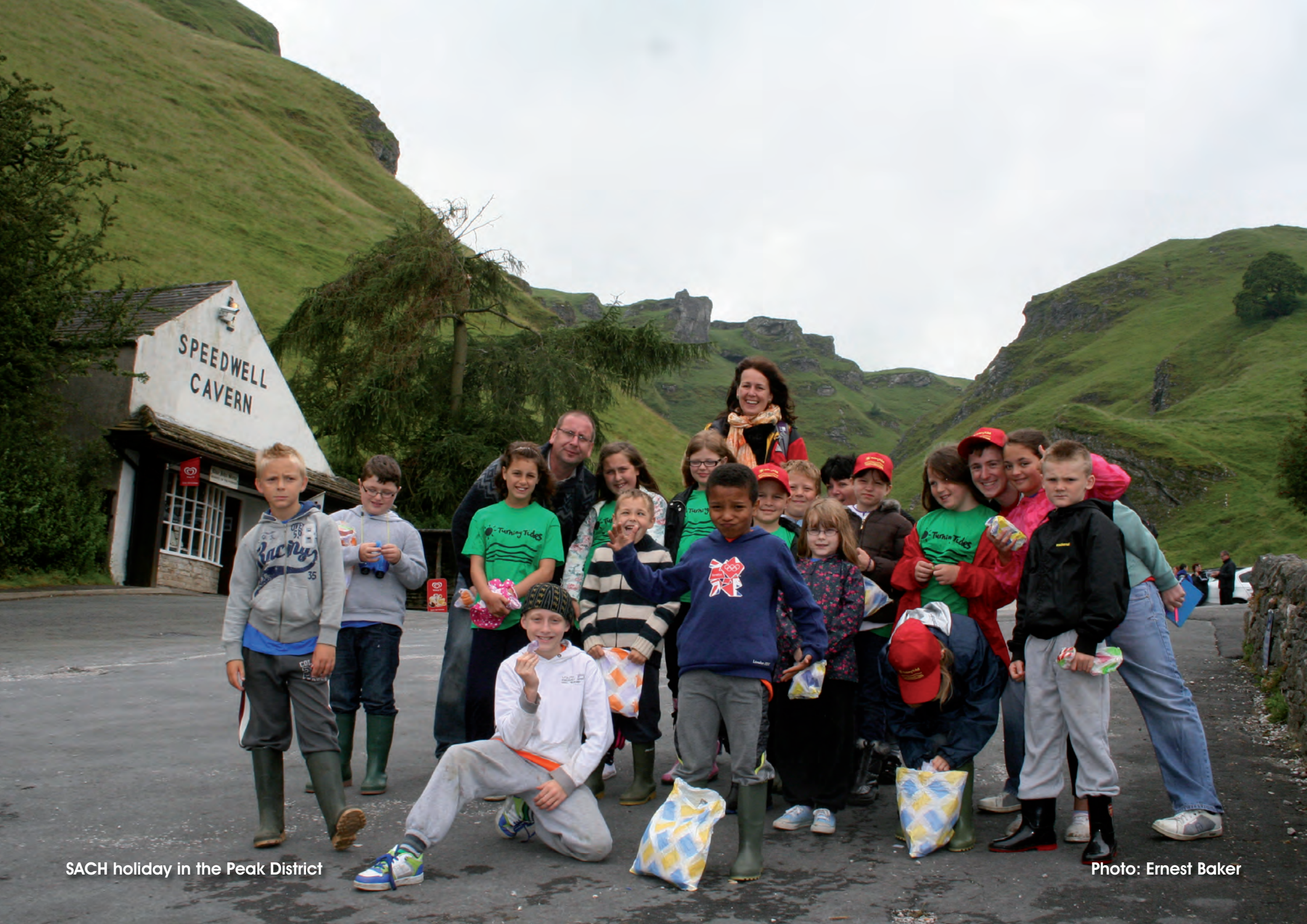
SACH holiday in the Peak District