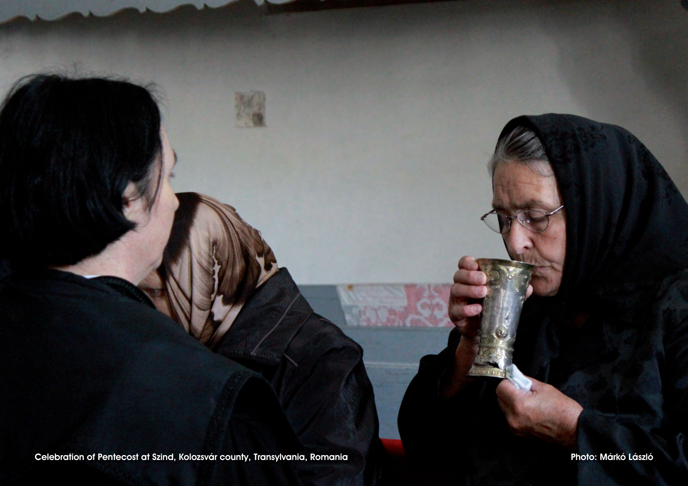
Celebration of Pentecost at Szind, Kolozsvár county, Transylvania, Romania