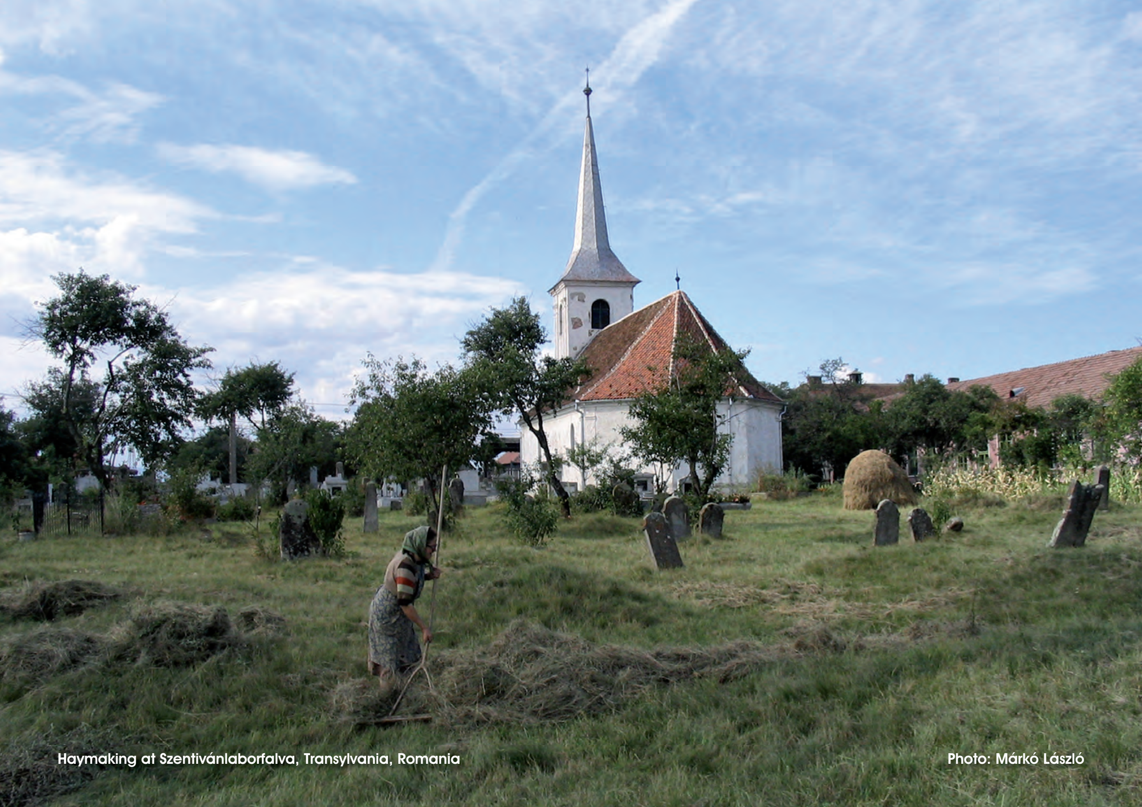
Haymaking at Szentivánlaborfalva, Transylvania, Romania