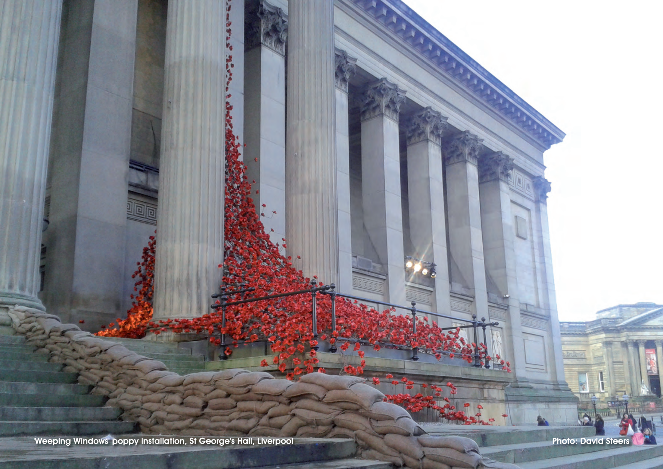
'Weeping Windows' poppy installation, St George's Hall, Liverpool