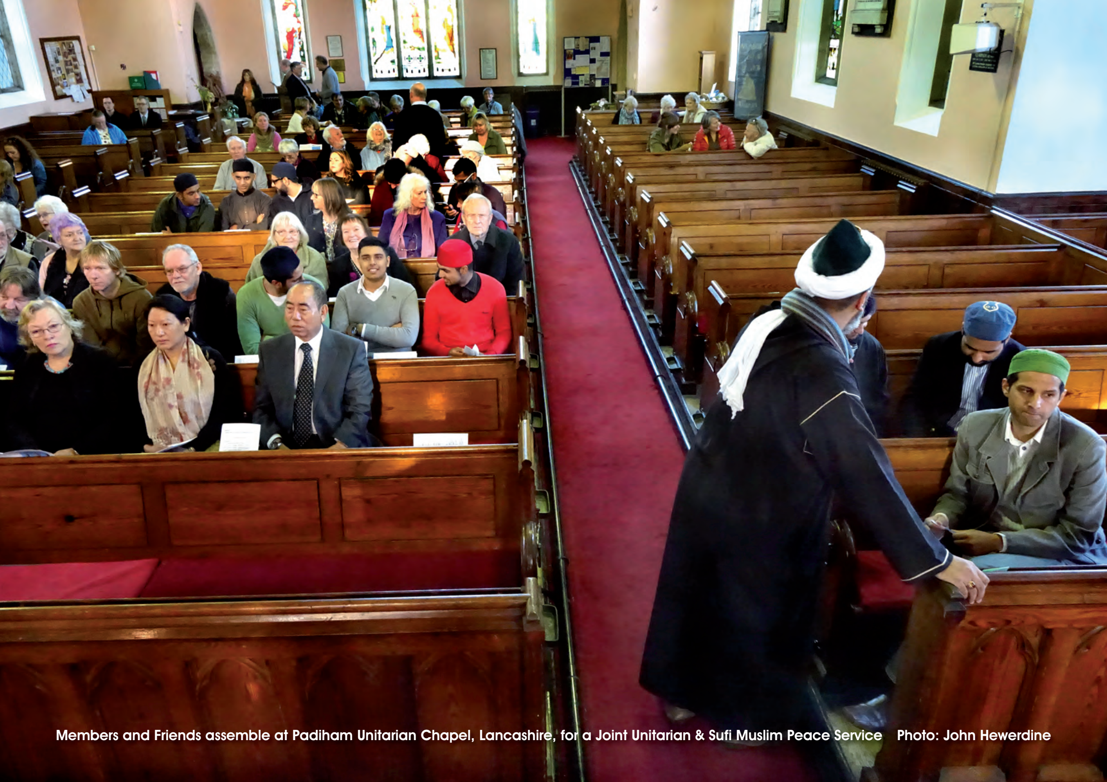
Members and Friends assemble at Padiham Unitarian Chapel, Lancashire, for a Joint Unitarian & Sufi Muslim Peace Service