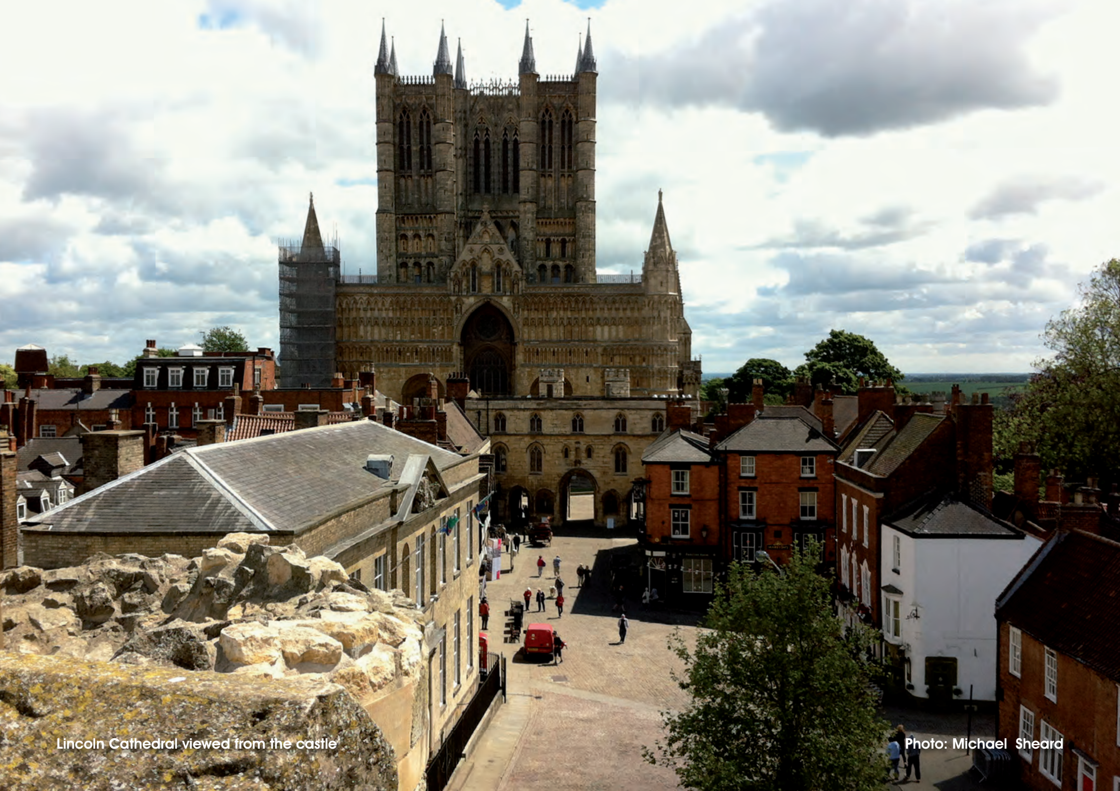
Lincoln Cathedral viewed from the castle