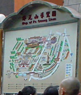
Students enter the Fo Guang Shan Monastery, Taiwan