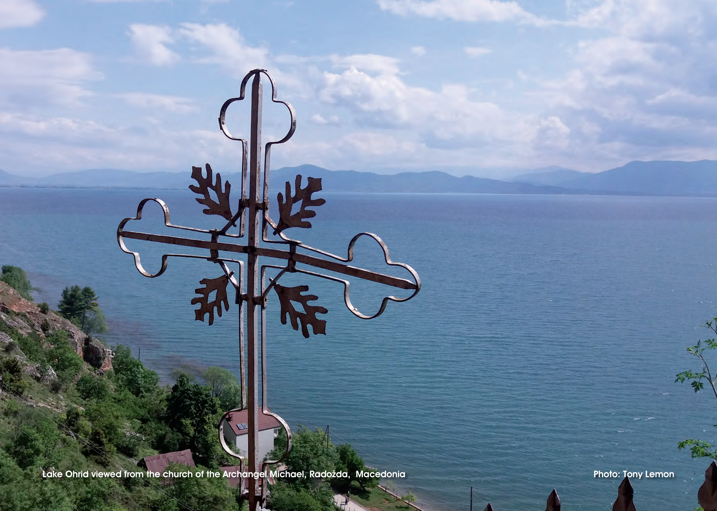
Lake Ohrid viewed from the church of the Archangel Michael, Radožda, Macedonia