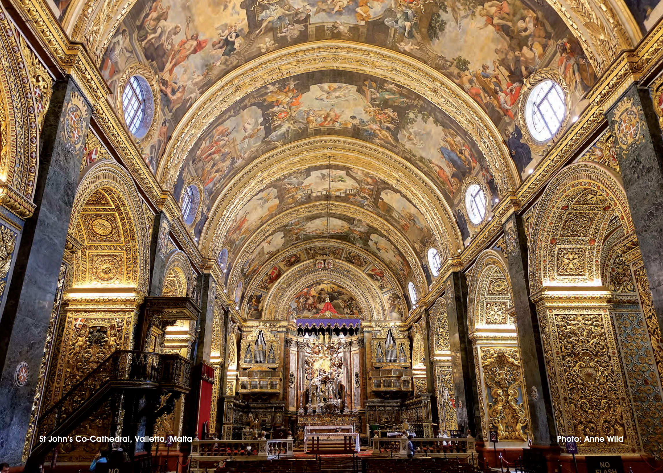
St John's Co-Cathedral, Valletta, Malta