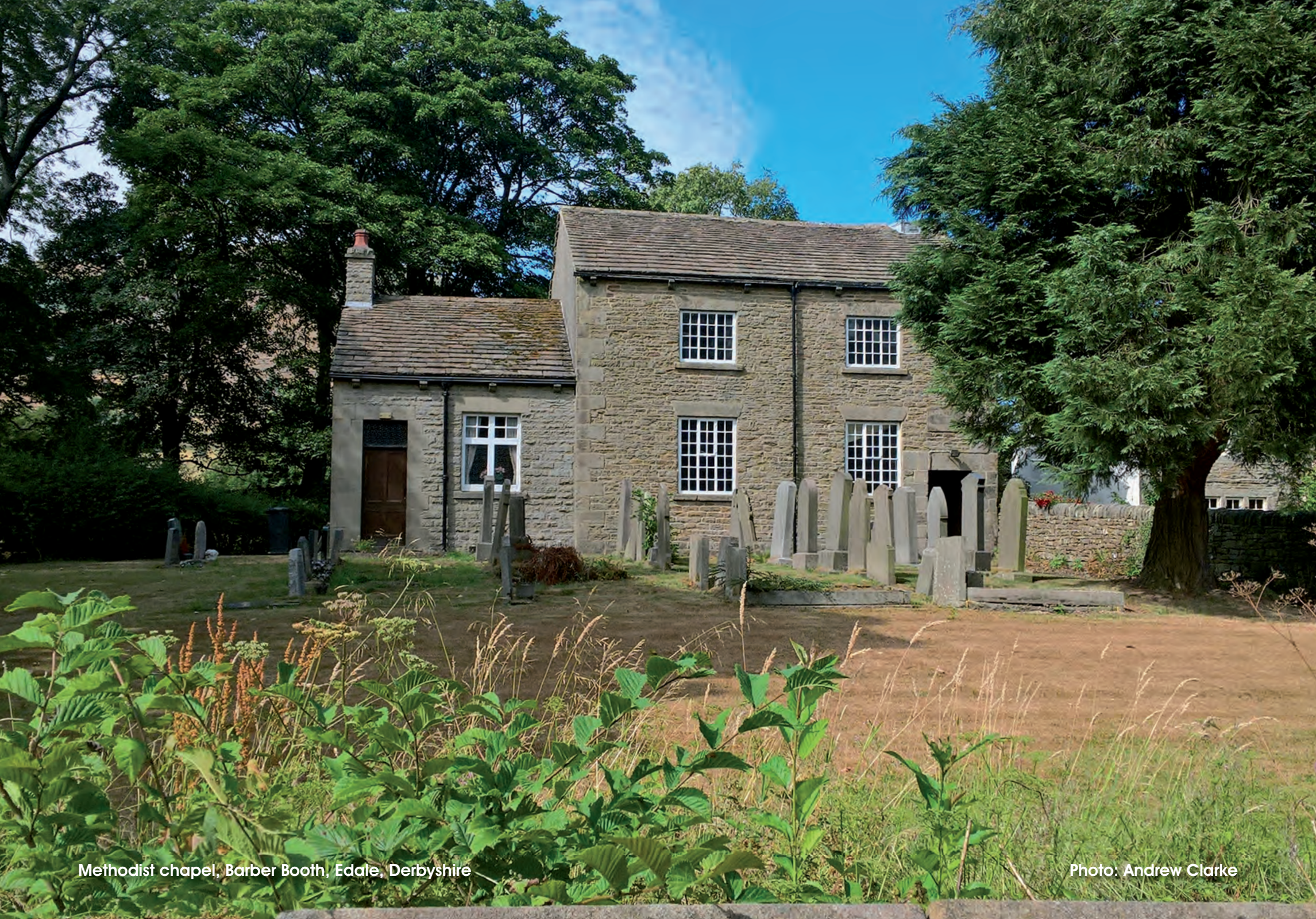
Methodist chapel, Barber Booth, Edale, Derbyshire