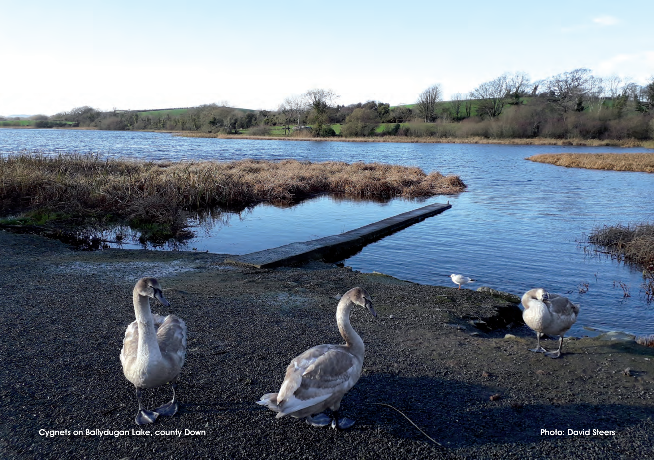
Cygnets on Ballydugan Lake, county Down