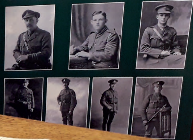
Commemorating the centenary of the end of WW1, Downpatrick

We remember all brave men who fought and died for freedom and on the centenary of the Battle of the Somme 1st July 1916 we celebrate the memory of the men of the 36th Ulster Division and in particular the memory of the men of County Down, some pictured below who fought in this battle.