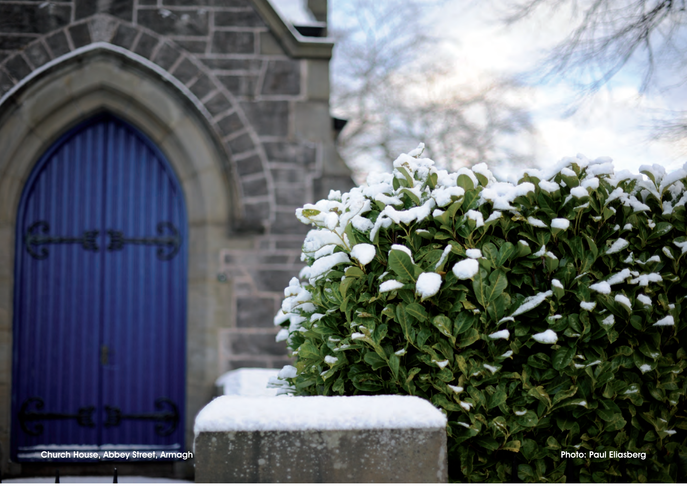
Church House, Abbey Street, Armagh