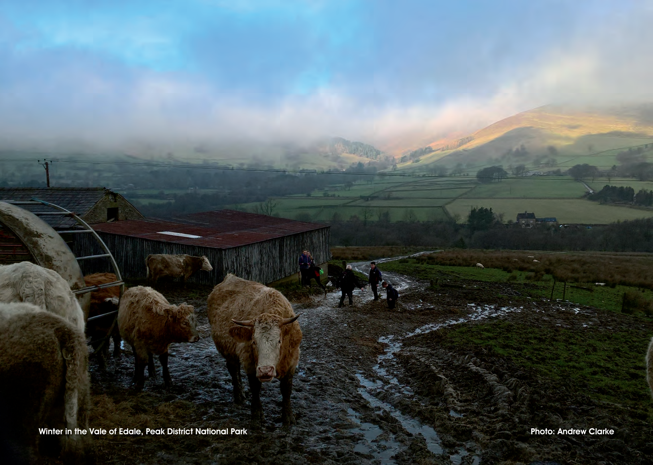
Winter in the Vale of Edale, Peak District National Park