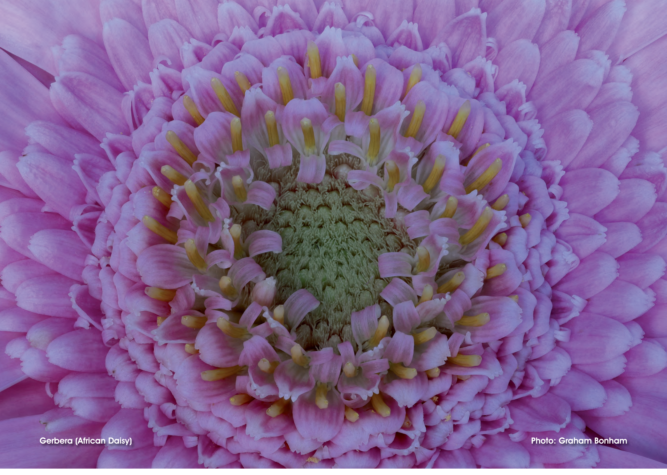
Gerbera (African Daisy)