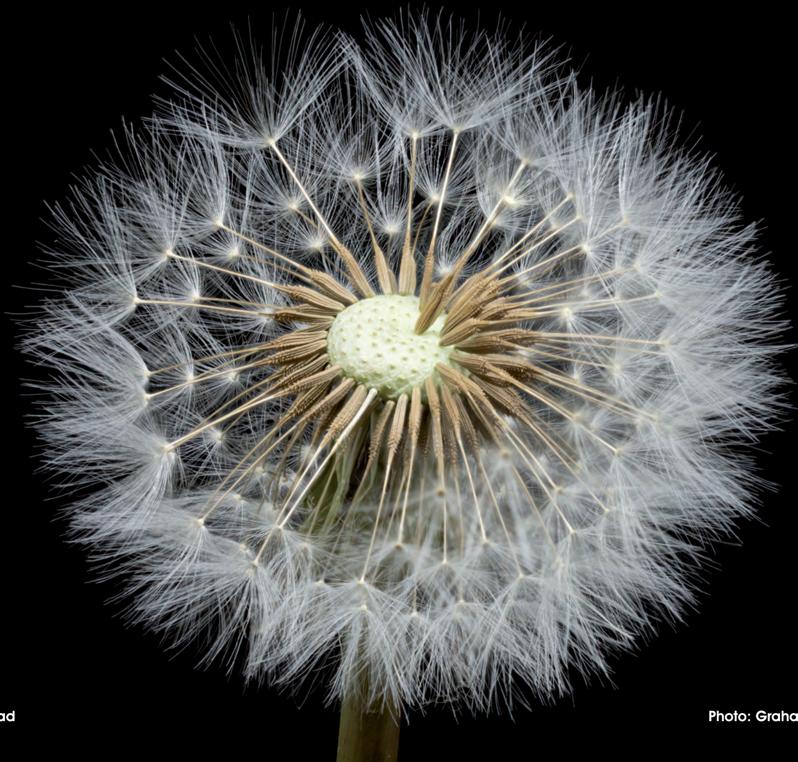
Dandelion seed head